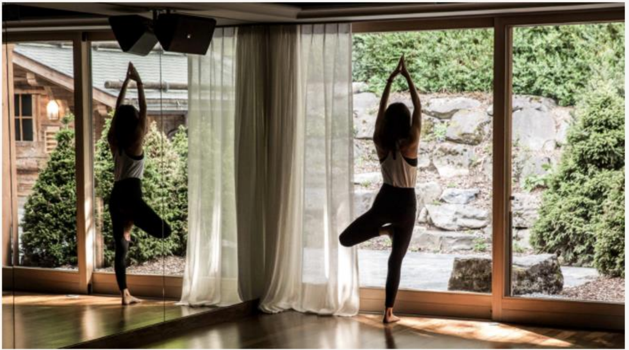
Interior of the Grand New Spa in Le Grand Bellevue.

The addition of two new relaxation areas and a private Alpine Spa Suite expands the spa's enormous footprint to more than 30,000 square feet, making it one of Europe's largest. Within the confines of the new suite, couples can enjoy side-by-side massages and a private Rasul chamber for steam-imbued body mud masks.