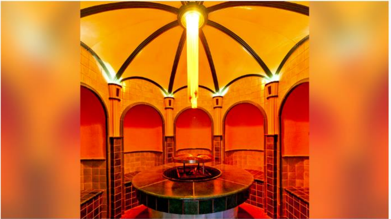
Herbal steam bath at the Grand New Spa in Le Grand Bellevue, Switzerland.

The interiors throughout the entire spa—refreshed with a new color scheme and subtle wooden accents that conjure Swiss chalets—reinforce a sense of place, while the labyrinth of 17 hot and cold therapy rooms comprise a journey of relaxation and recovery. The heat of the Finnish sauna encourages circulation to quadriceps après ski while the Laconium, prized by ancient Romans, detoxifies. A Turkish steam bath, Himalayan salt grotto, ice cavern, and infrared and softly scented hay saunas are as soothing to be in as they are healing.