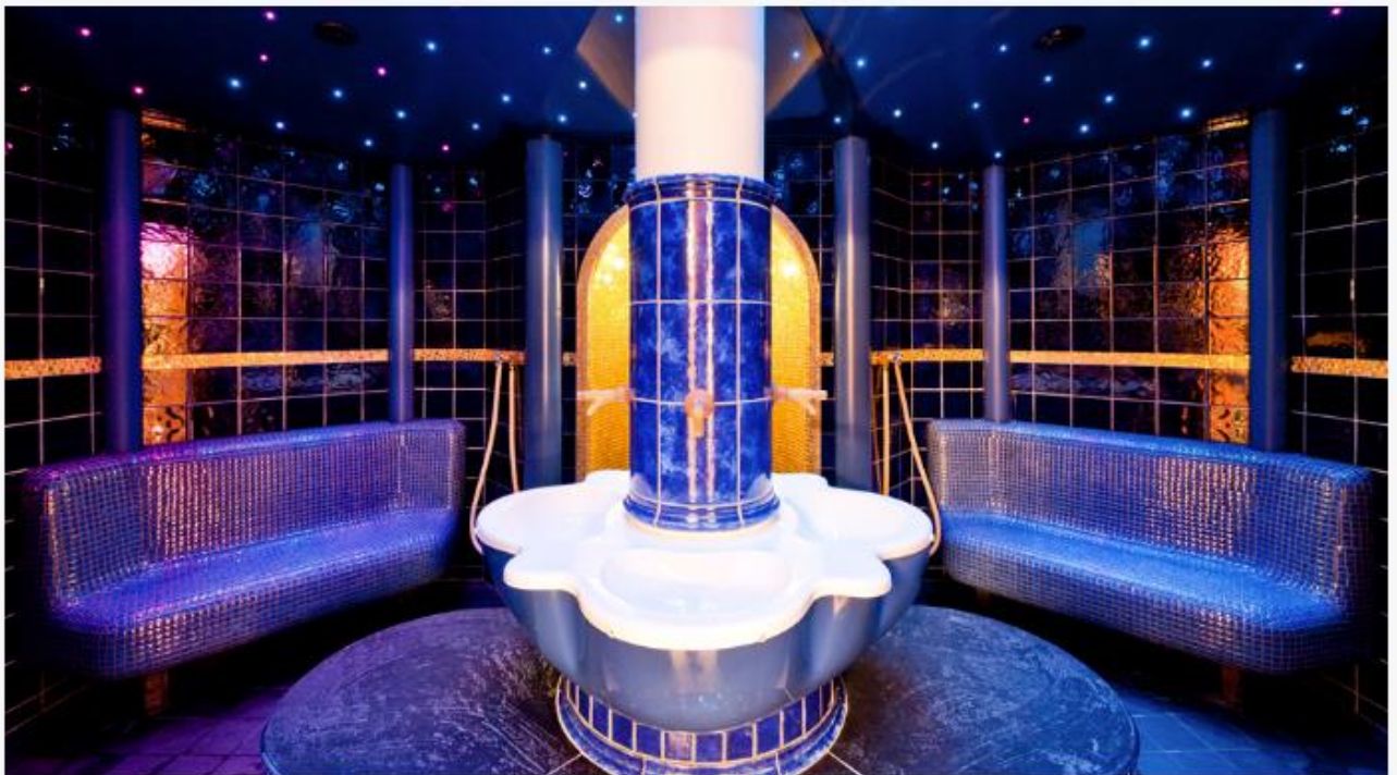
Turkish Hammam at the Grand New Spa in Le Grand Bellevue, Switzerland .

The addition of two new relaxation areas and a private Alpine Spa Suite expands the spa's enormous footprint to more than 30,000 square feet, making it one of Europe's largest. Within the confines of the new suite, couples can enjoy side-by-side massages and a private Rasul chamber for steam-imbued body mud masks.