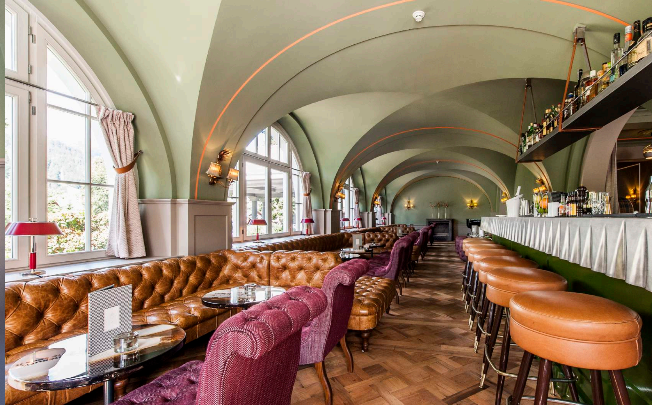
A reception can be held here for 40 90 guests, while a seated lunch or dinner can be held here for 30 50 guests