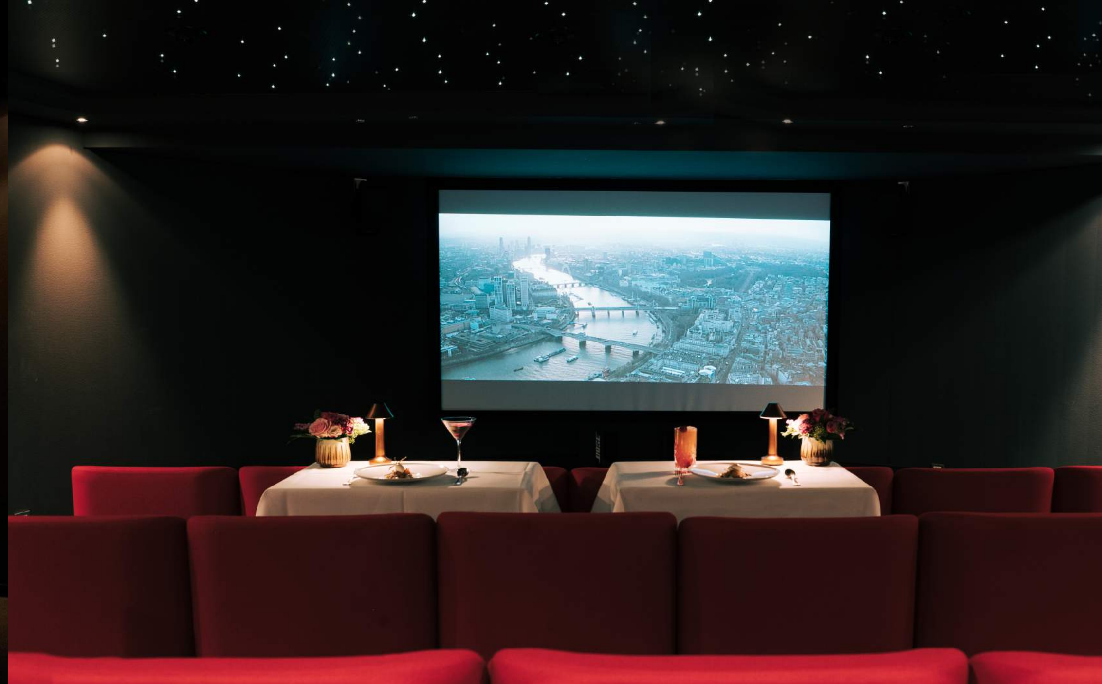
A private cinema with a capacity of 20