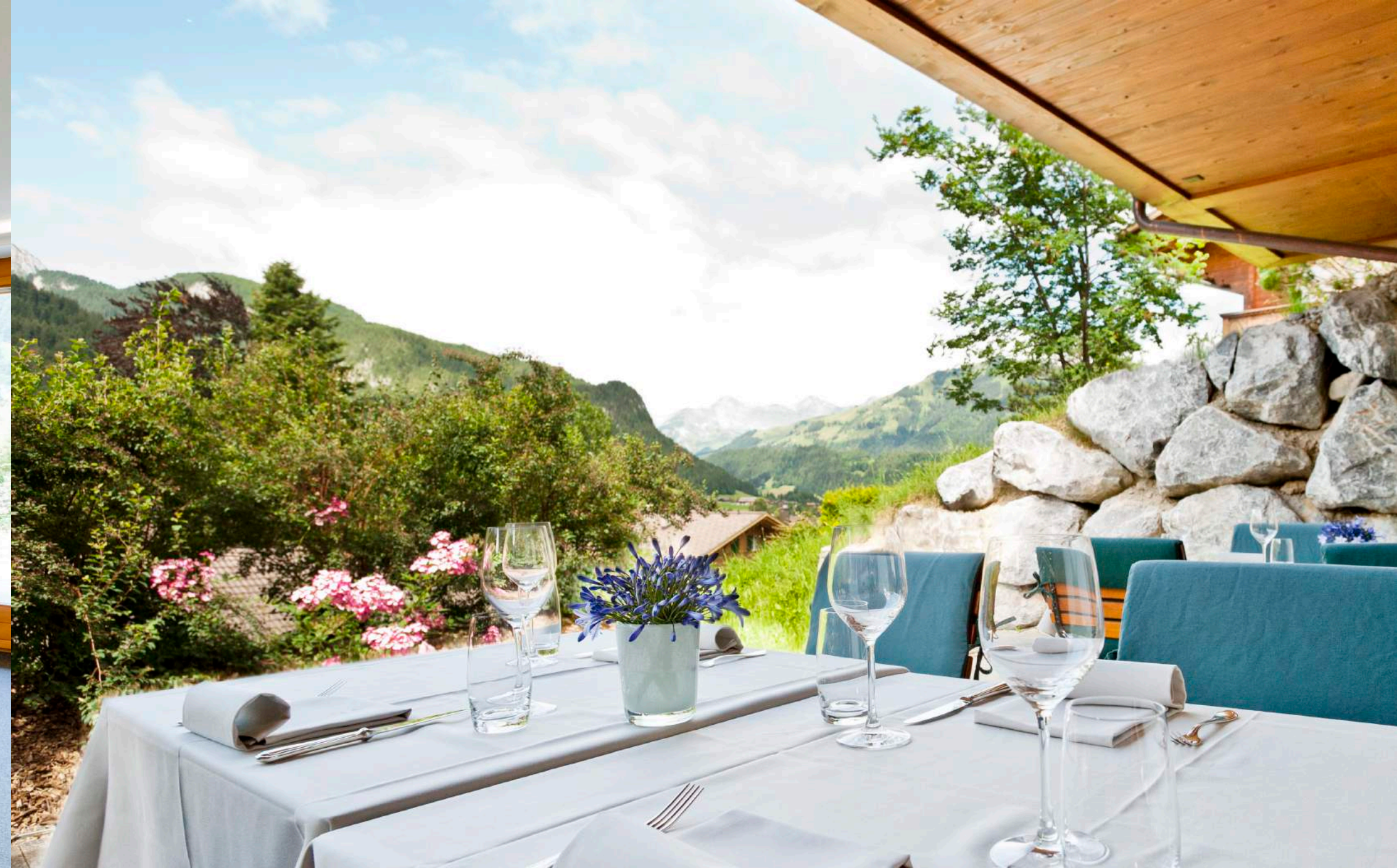
Various meeting spaces with optional outdoor space