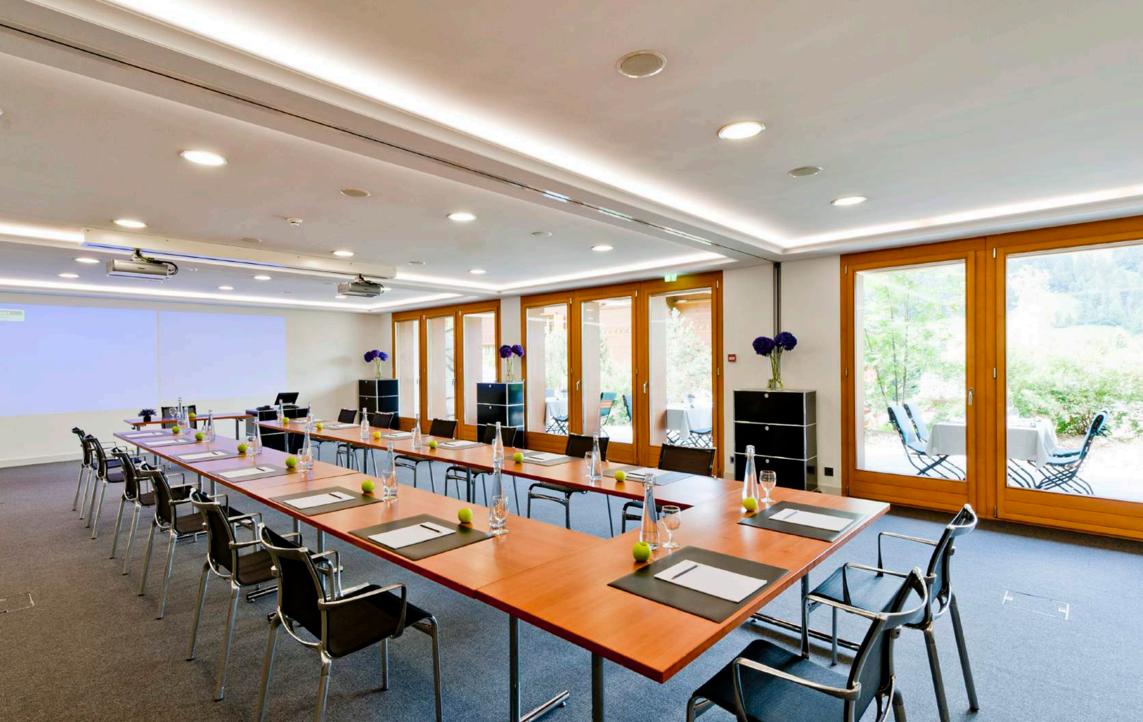
PENSADOR MEETING ROOMS