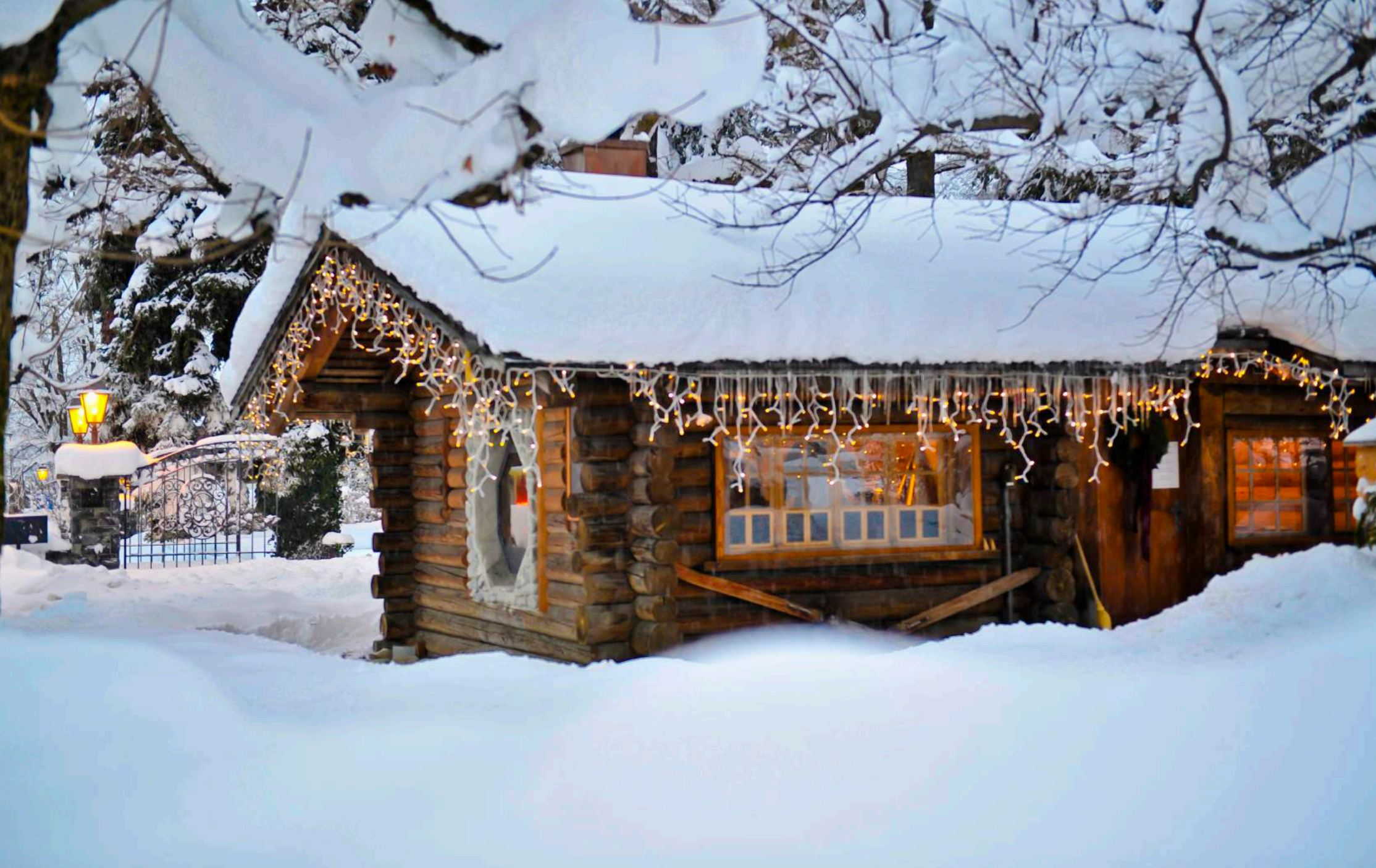
LE PETIT CHALET