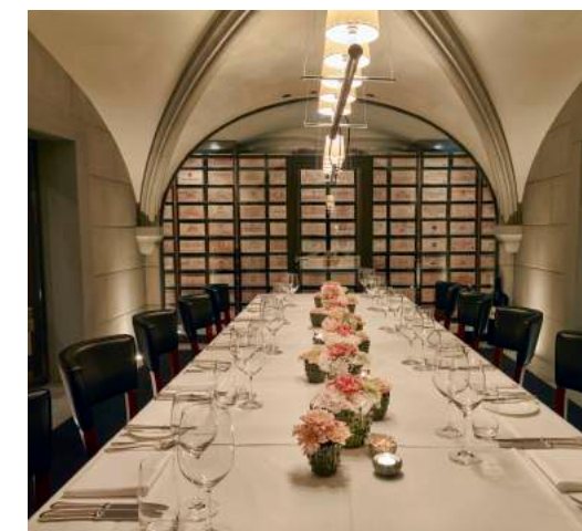
LEONARD's Wine Cellar