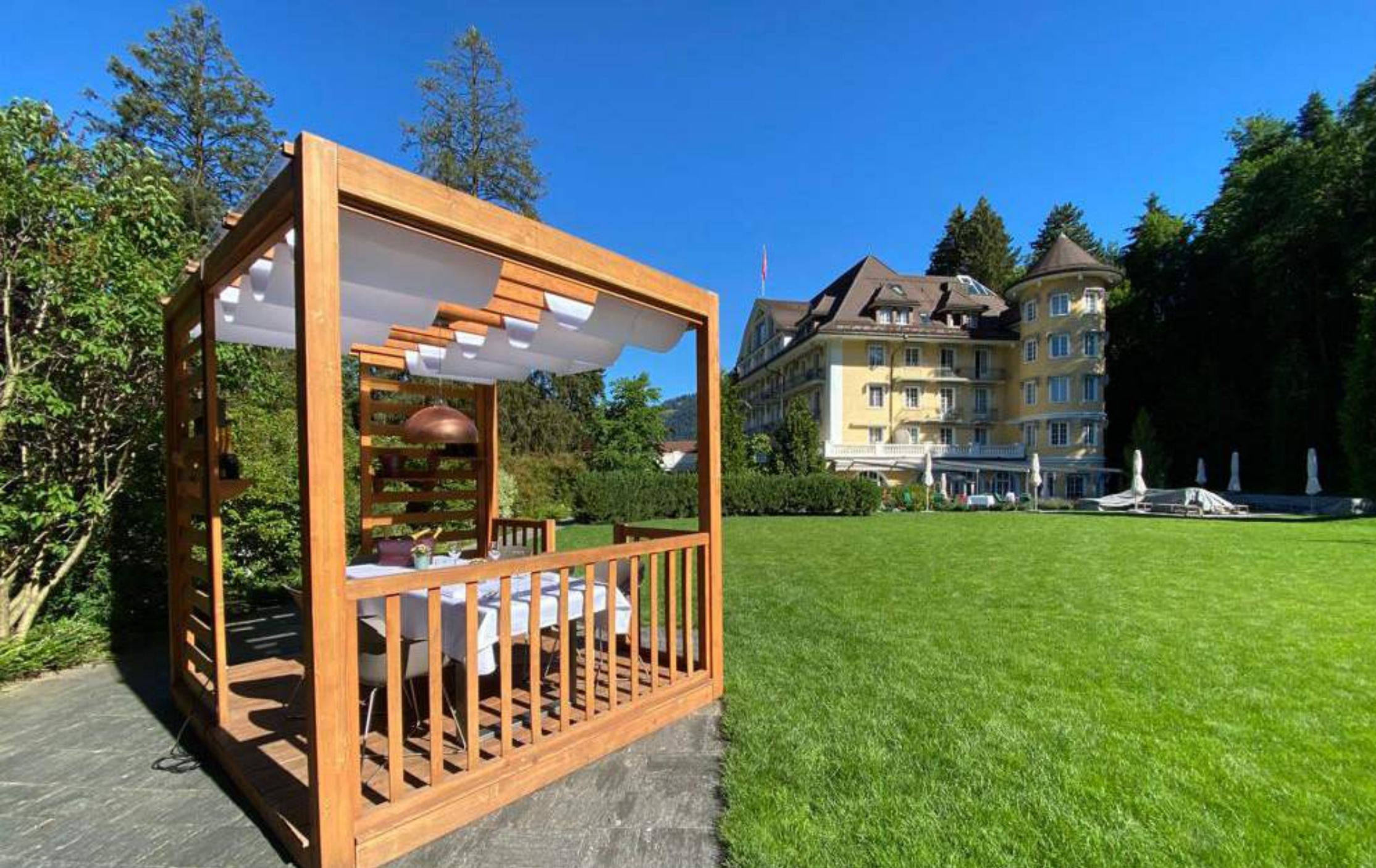
SPECIAL OUTDOOR SET-UPS