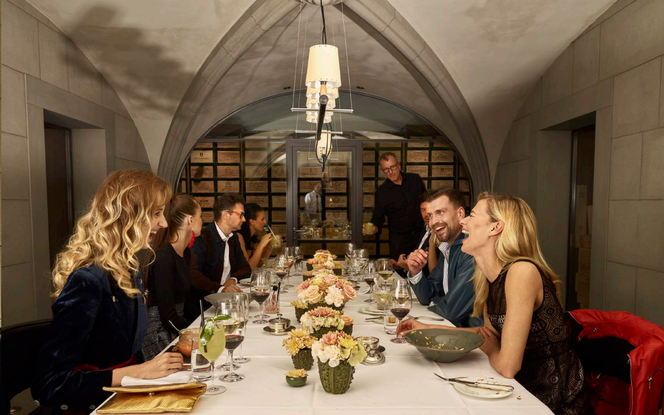
This is a private dining room for 8-22 guests