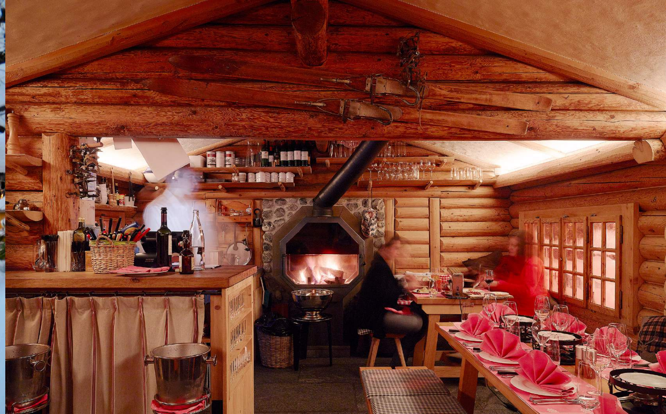
An authentic Swiss space with a maximum capacity of 24 guests for intimate private events.