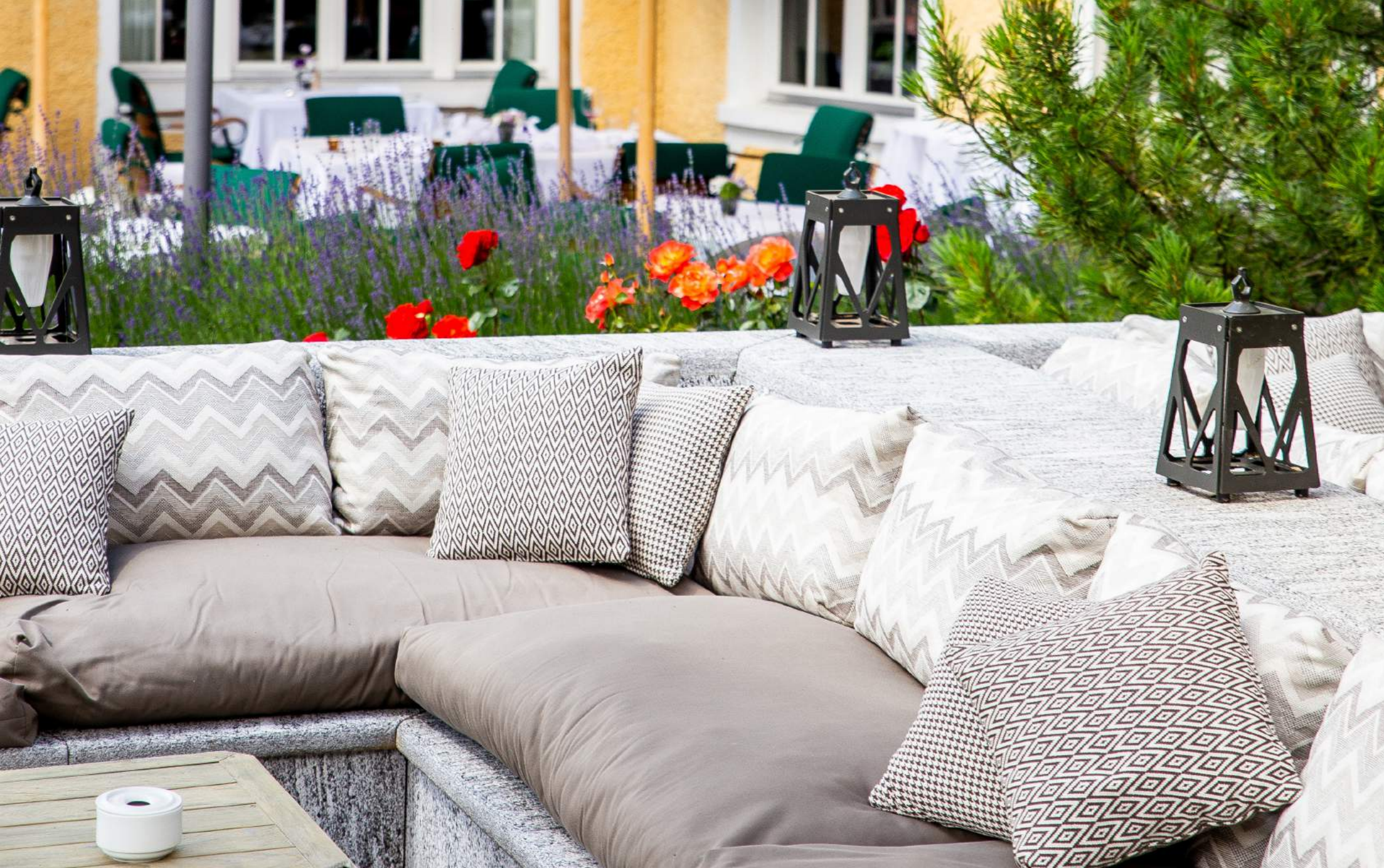
THE GARDEN LOUNGE