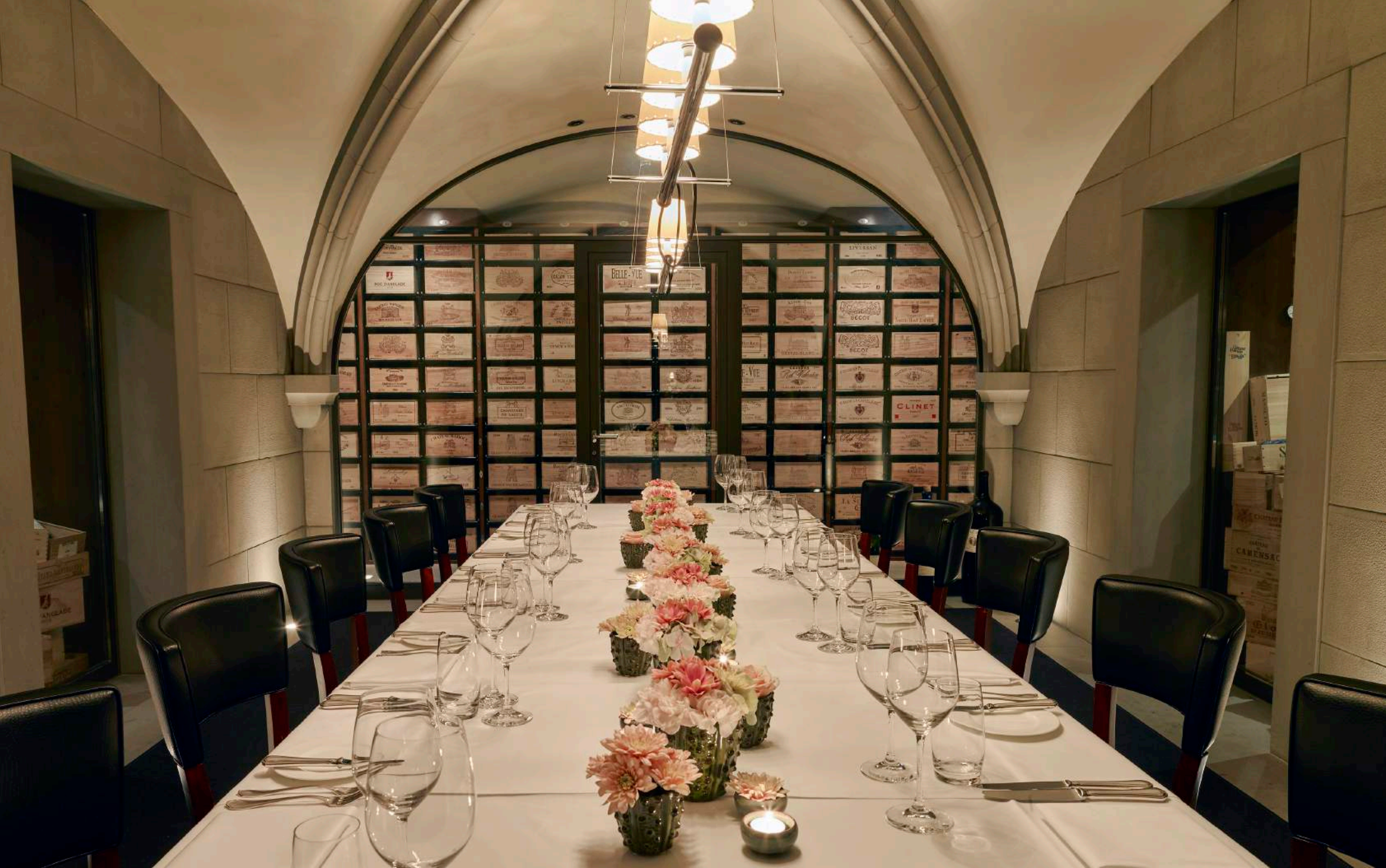
LEONARD'S PRIVATE WINE CELLAR