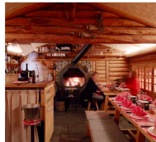
Le Petit Chalet