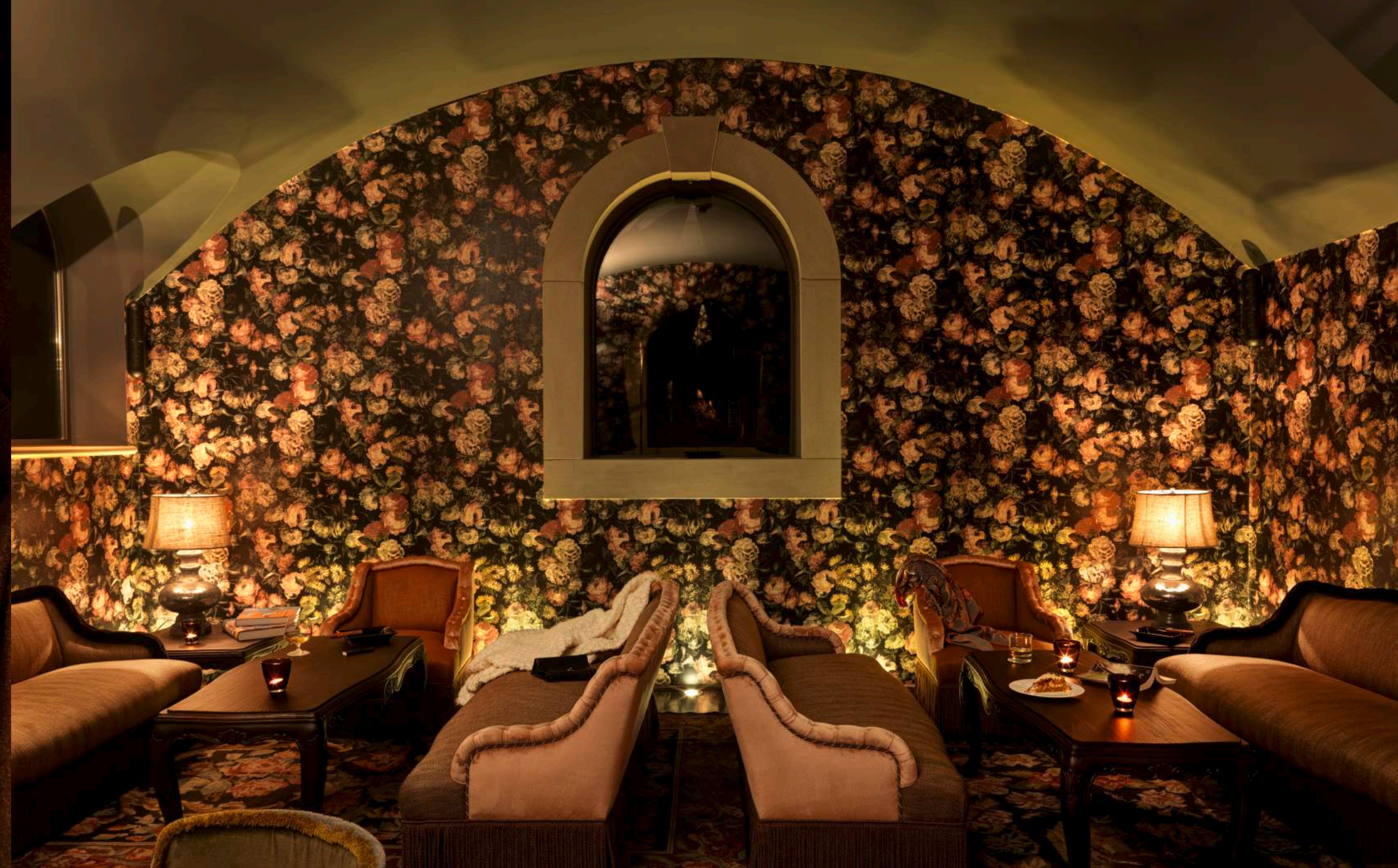
The hotel's nightclub offers a bar and an adjacent cigar lounge. The capacity is 80 to 150.