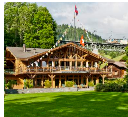
Gstaad Yacht Club