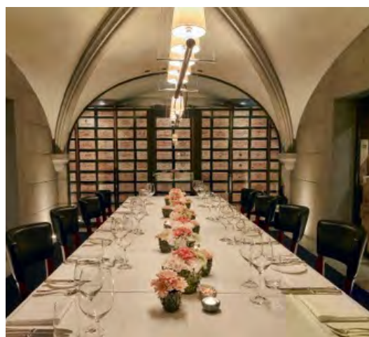
Leonard's Wine Cellar