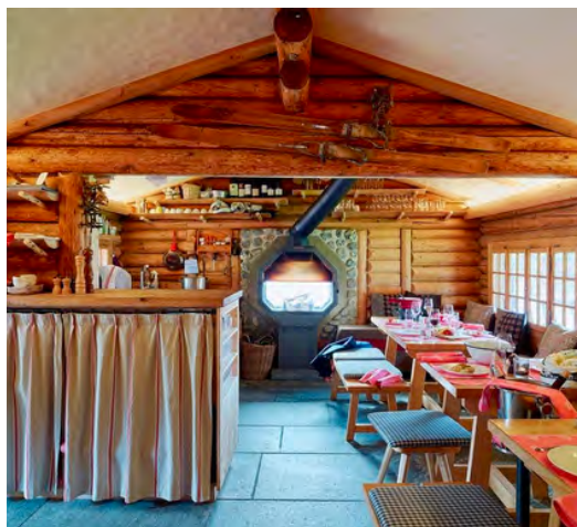
Le Petit Chalet